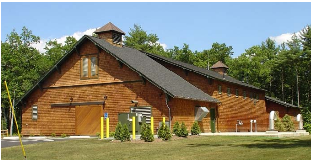
Nutting Road water treatment plant

tem. The Department provides this service while meeting various state and federal requirements. Protecting the ground water resource is the first priority.